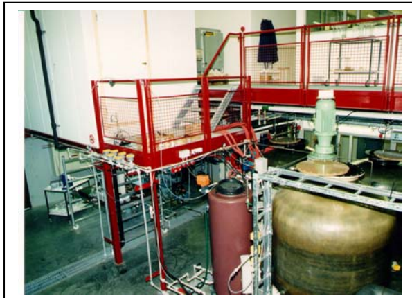
Continuous Flow test Systems

The four companies TotalFinaElf, Agip, Statoil and Norsk Hydro are the industry partners in the project. They have been taking actively part in the project definition, execution and results utilisation. The project's work contribution from TotalFinaElf was part of the company's research program performed at Akvamiljø in 1998 - 2000. Several tests were also carried out in the Statoil, ENI-Agip and TNO laboratories in Trondheim, Milano and Den Helder.